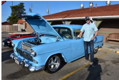
Beautiful Chevy (1956?)