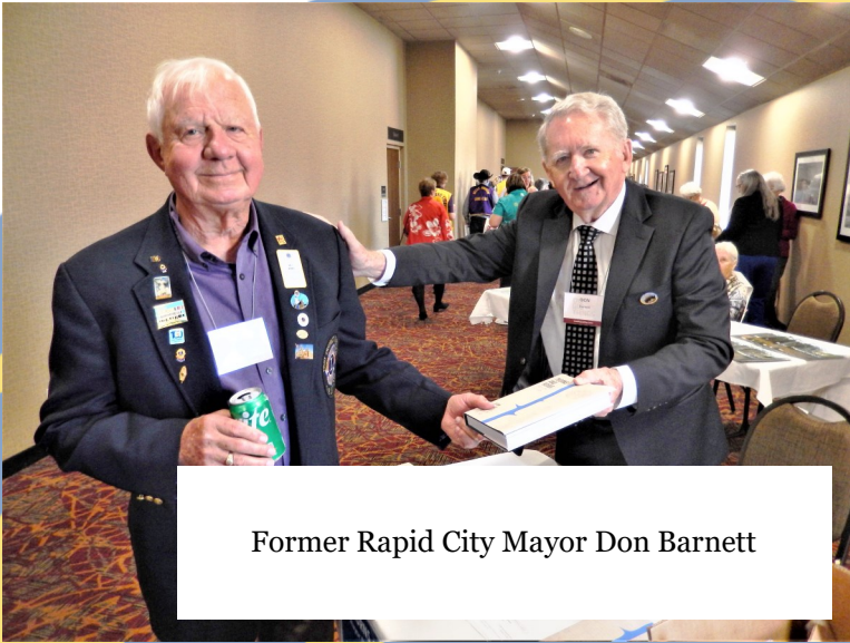
Former Rapid City Mayor Don Barnett