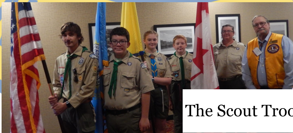
The Scout Troop Honor Guard