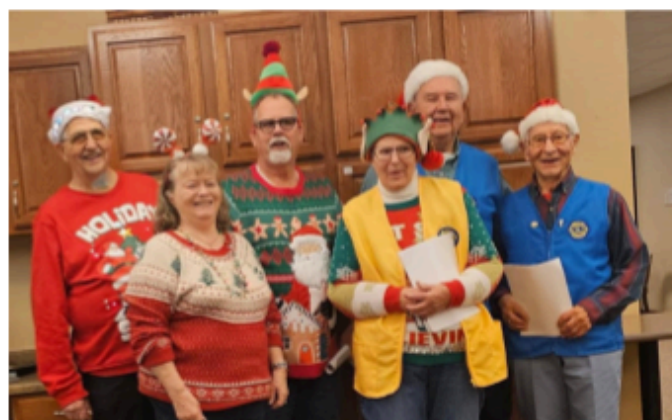
Caroling at Edgewood Senior Living Center