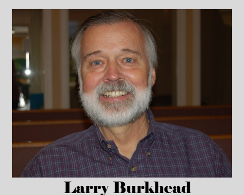
District 58W Secretary 1998-99 District 58W Governor 2010-11 March 7, 1953—August 23, 2016