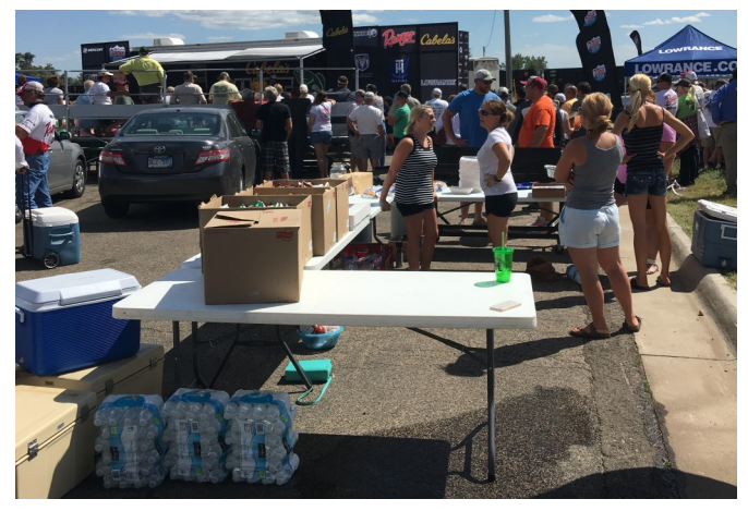
<u>Fish Days.</u> The Mobridge Lions Club serves food for the Cabela's National Walleye Tour on Aug. 4 and receives a donation of $300 plus $190 in tips.