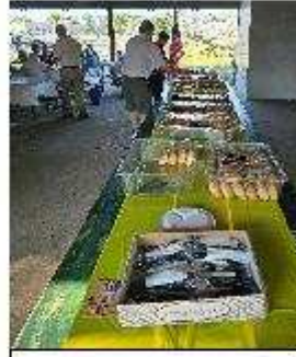
Food for everyone