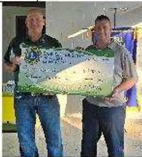
Carlisle Fire & Rescue receives donation