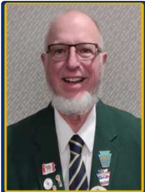
District Governor Galen Burkholder