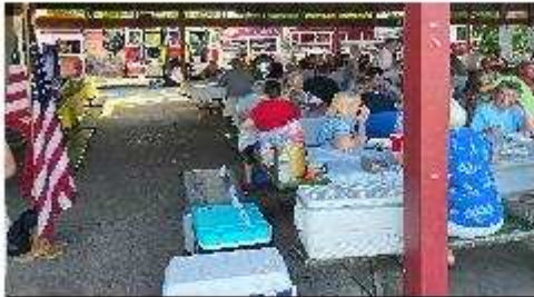
Lions and first responders enjoying the catered BBQ dinner.