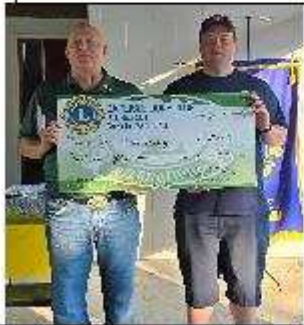
Union FD No1 receives donation