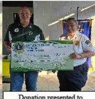
Donation presented to Carlisle Regional Special Police