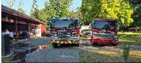
Local Responders Join the Activities