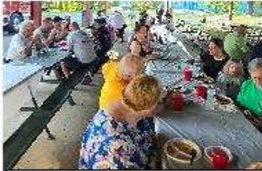
Lions and first responders enjoying the catered BBQ dinner.