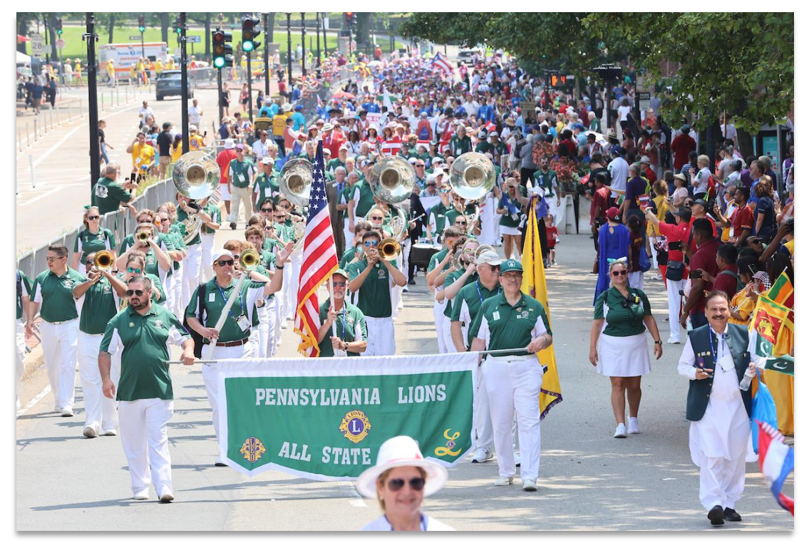
The All State Pennsylvania Band marches in the parade