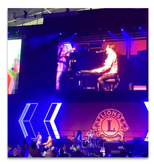
Queen tribute band Killer Queen performs at the Convention