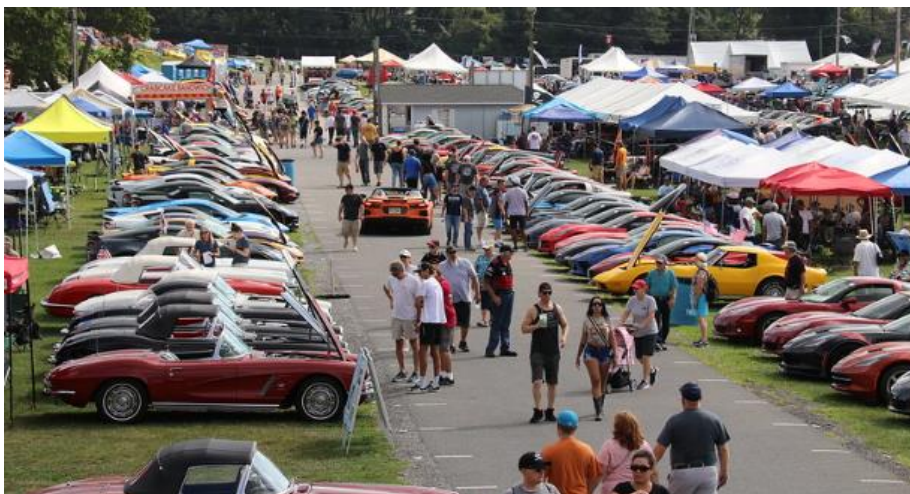
All types of Corvettes on display at the show

On August 22 - 24 area Lions Clubs greeted visitors to the 2024 Corvettes at Carlisle. Area Lions collected donations for their respected clubs Vision Programs.