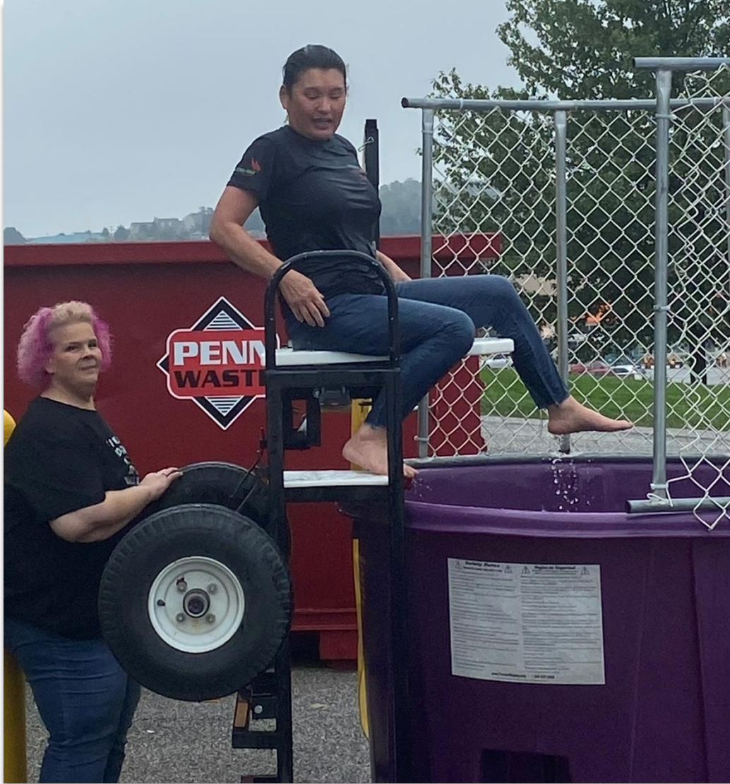
Pen-Mar associates manning the dunk tank.

On October 4 th , the Shrewsbury Lions Club and Pen-Mar hosted a Carnival at the Pen-Mar Building located on Far Hills Drive in New Freedom. Volunteers from M&T Bank and Bank of America greatly assisted the event, but the highlight of the day was the dunk tank and free food for all.