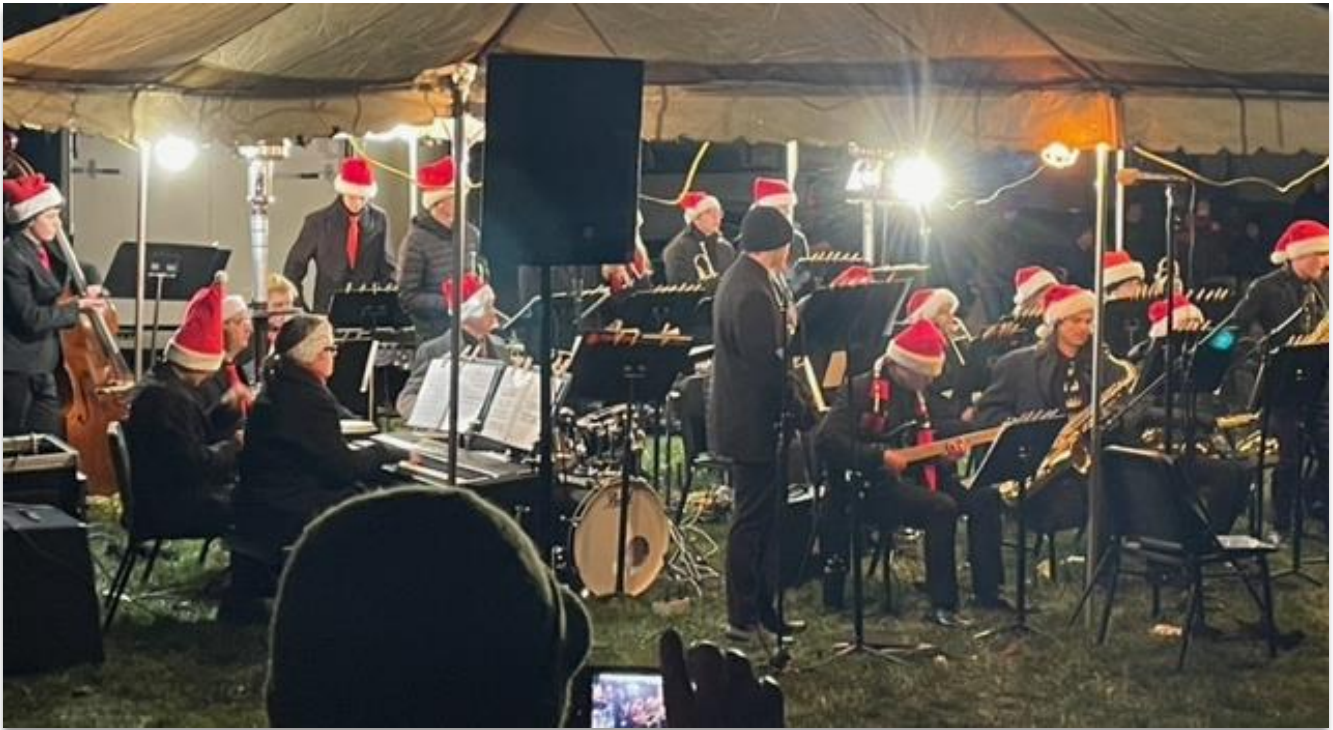
The local high school jazz band played festive tunes on November 30 th as the New Freedom club held their annual tree lighting and Santa's grand arrival on a Rose Fire Company ladder truck.