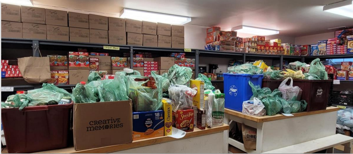
Food collected for SYCFP

Shrewsbury Lions Club held a food drive on November 23, 2024 at Saubel's to benefit the Southern York County Food Panty. In addition, gently used coats, hats, and scarves were collected for Coats of Friendship. In addition to the 1, 545 lbs. of food collected for the Southern York County Food Pantry, the club presented a check of $600 for future needs.