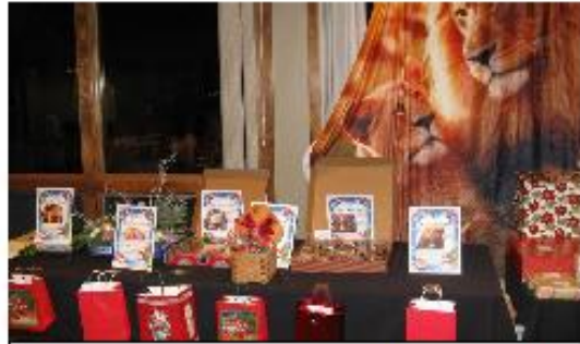
Silent Auction raised over $400 dollars for Beacon Lodge.