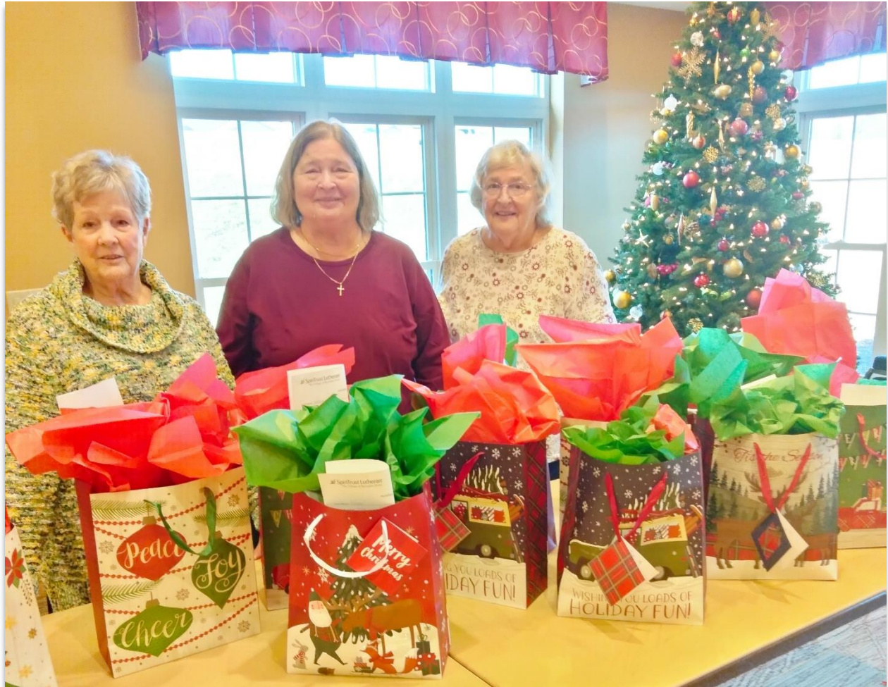
Yorktowne members prepare gifts for distribution

The Yorktowne Lions Club routinely distributes holiday gifts to residents of SpiriTrust Lutheran Sprenkle Village's Assisted Care, Memory Care, and Skilled Care facilities. This year's Christmas gifts included poinsettias and wish-list items. The Club includes other holidays in its gift program distributing small remembrances or greeting cards for Valentine's Day, Easter, July Fourth, Halloween, and Thanksgiving. The program is intended to let patients in these units know that they are remembered on these important holidays, not only by family and friends, but also by the community at large.