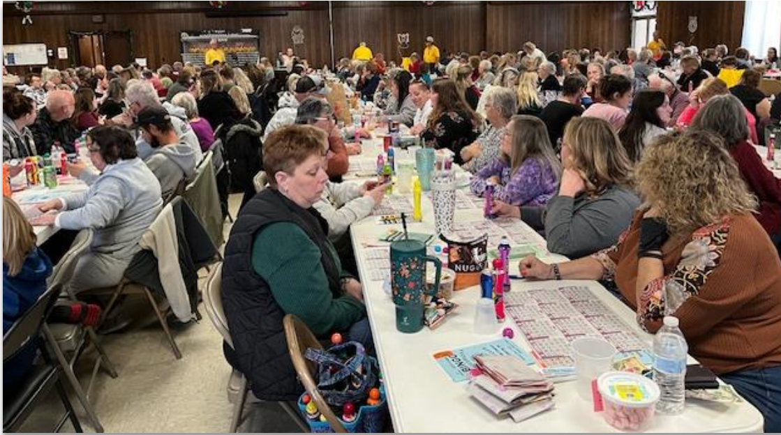
Gift Card Bingo on December 1st