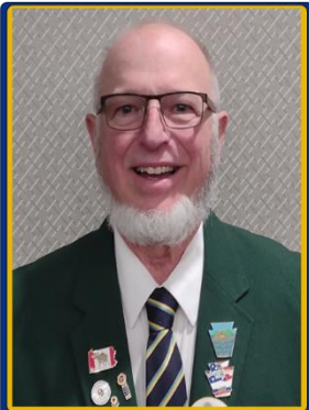
District Governor Galen Burkholder