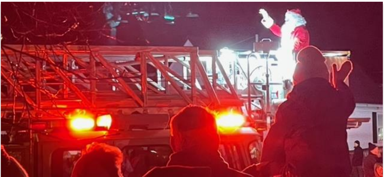
Santa arrives in New Freedom