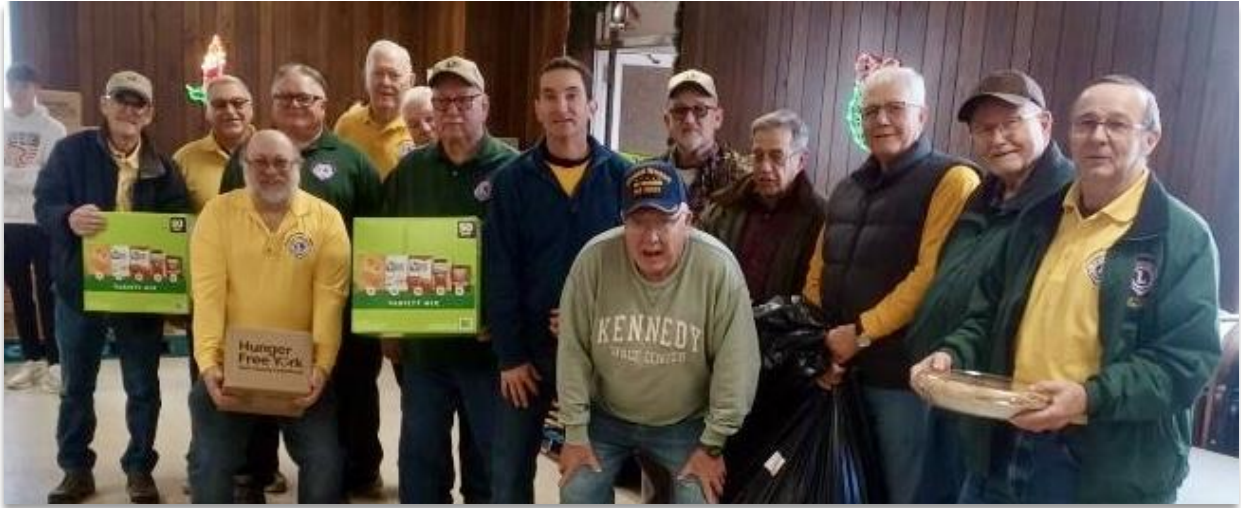
Club members carrying items to the recipient's cars

The Susquehanna Lions held their Annual HELP YOUR NEIGHBOR PROJECT , on December 19th at the Union Firehall in Manchester, PA. Each family received a bag of gifts in addition to a fruit box, a snack box, a bag of fruit and an apple pie.