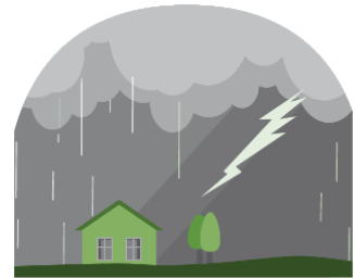
Thunder and Lightning