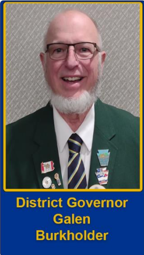
District Governor Galen Burkholder