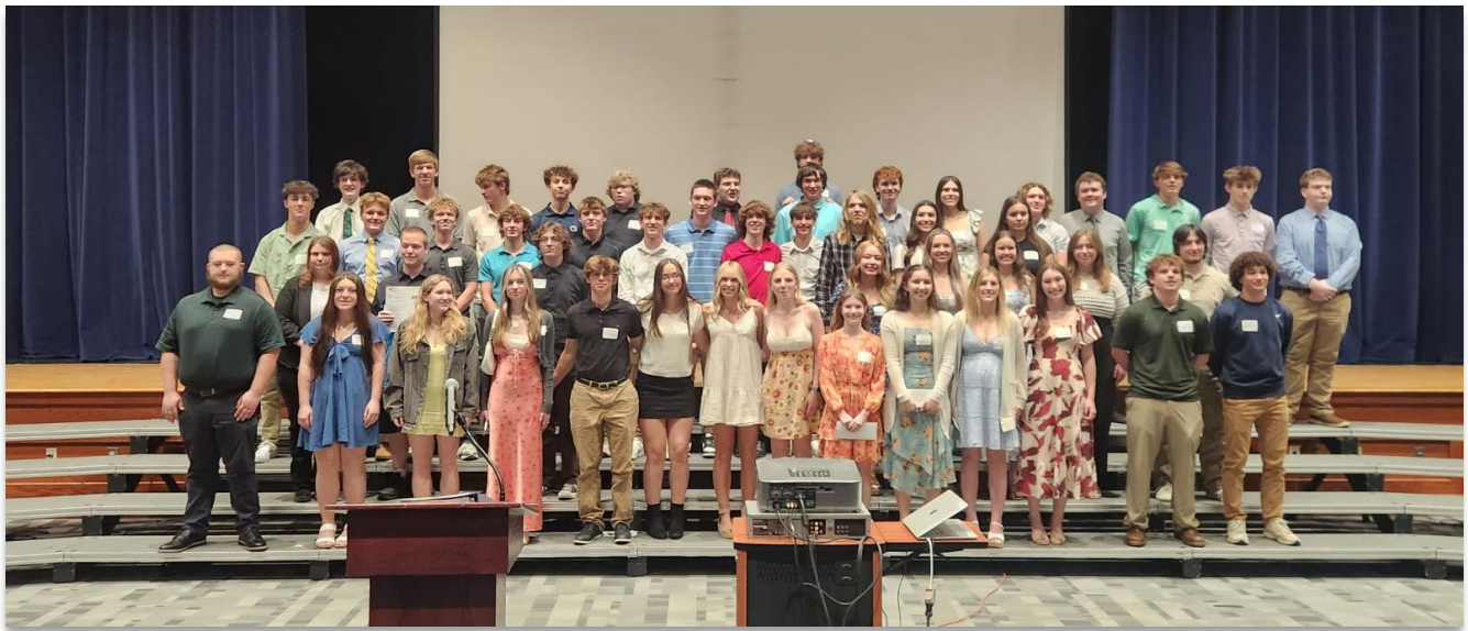
Dollars for Scholars Award Recipients