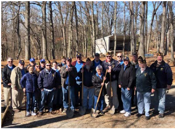
The Dallastown Lions Club and the Dallastown American Legion, Post 605

Dallastown community organizations are working together to bring much needed improvements to our Lions Club park! The Dallastown American Legion Post 605, the Dallastown Area High School Leo Club, and the Pennsylvania Lions Foundation have teamed up with the Dallastown Lions Club to install new playground equipment for children ages 2 to 5, and also specifically for children in our community who have disabilities and challenges.