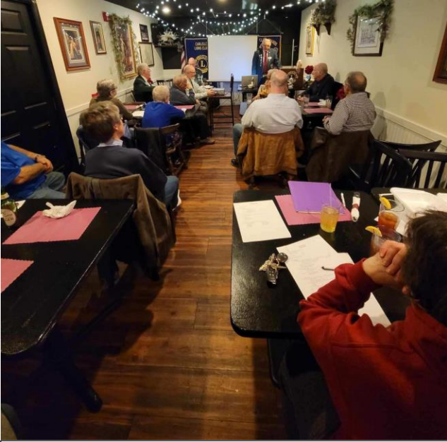
Carlisle Lions Club at the Market Cross Pub listening to District 14-C Governor