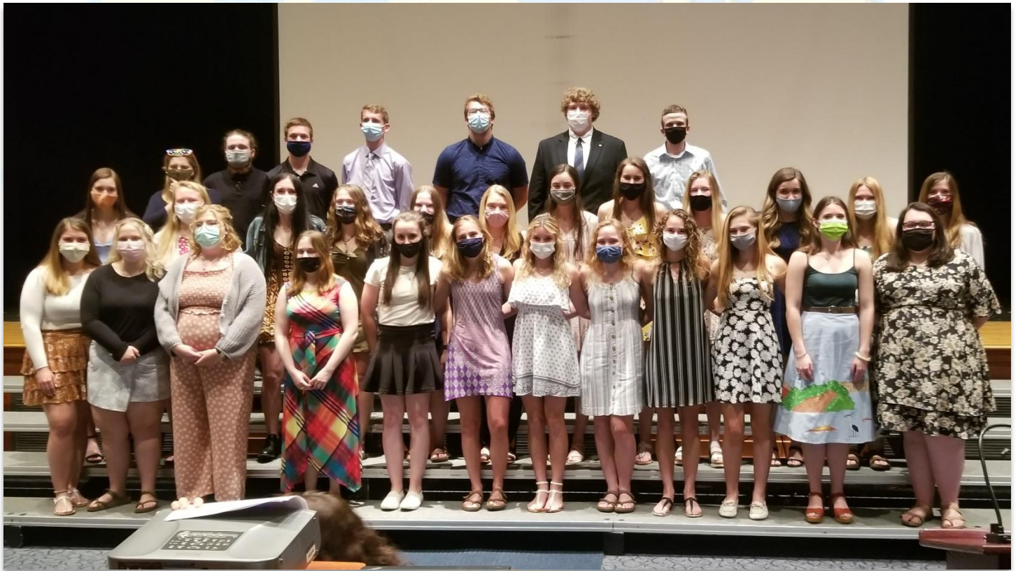
Dollars for Scholars Award Winners