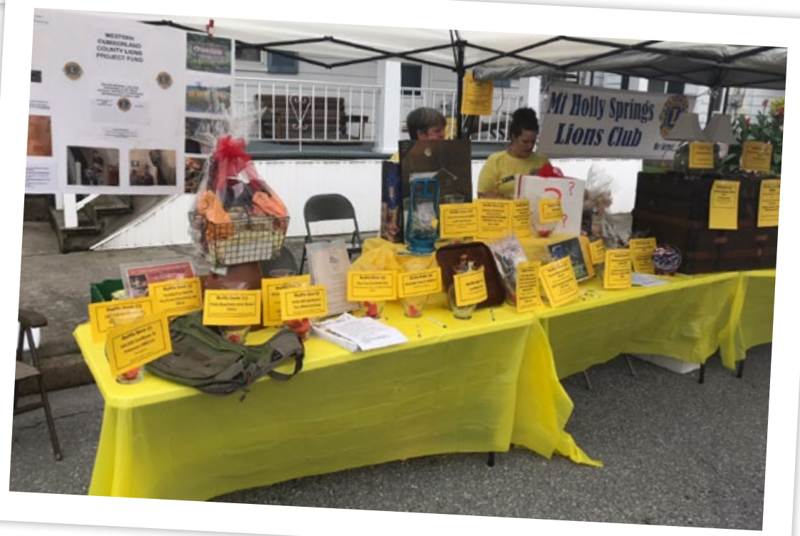
Members of the Mt. Holly Springs Lions Club