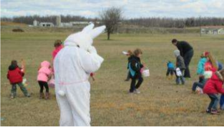
Left: The Easter Bunny welcomes everyone to the Jacksonville Lions Easter Egg Hunt.