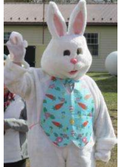
Right: The Easter Bunny encourages children to find hidden candy and eggs.