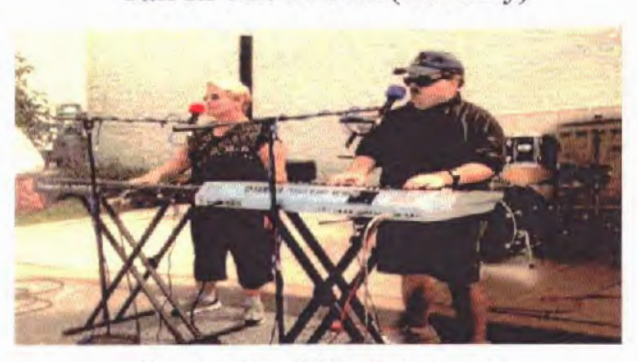
Two of a Kind (Oldies)