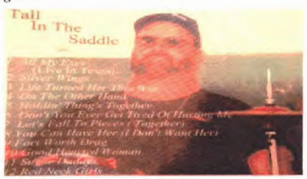
Tall In The Saddle (Country)