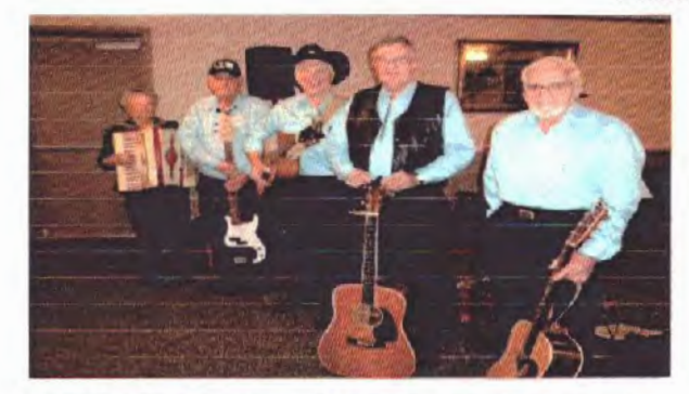
Hillbilly Heaven (Blue Grass + Gospel)