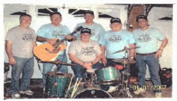
Reminisce (Country + Gospel)