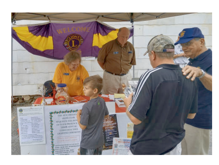
Looking for new members young or old at the New Freedom Fest.