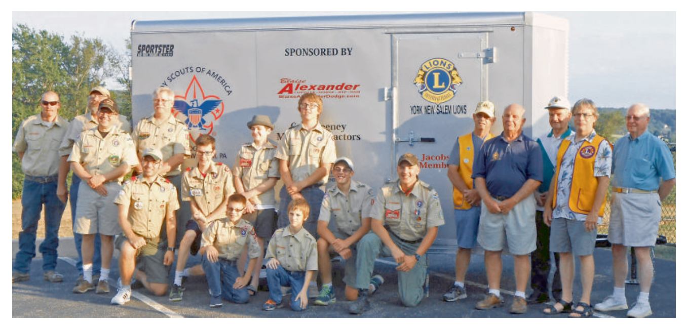
The York New Salem Lions Club and York New Salem Boy Scout Troop 97 joined together to purchase a trailer to transport camping equipment on their trips. In return for the Lions donation the scouts continue to help the Lions at their Chicken barbecues.