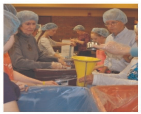
Executive Officers, Lions and LEO's Working together to feed the hungry.