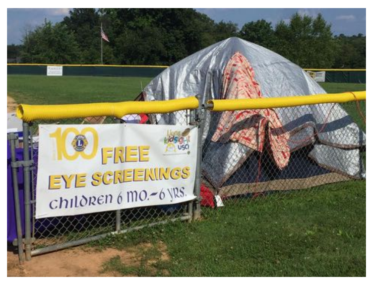
Dillsburg Lions offered free vision screenings at the Carroll Township National Night Out event.