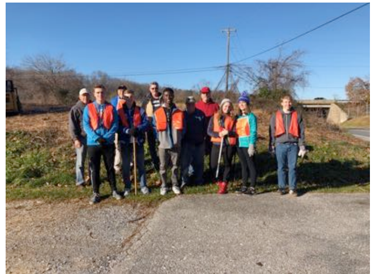
The Dallastown Lions Club and the Dallastown Leos supported our LCI Environmental Initiative by conducting its semi-annual Adopt-A-Highway Road Clean Up on Hess Farm Drive along Lake Redman. With the help of our Lions and Leos, the road and lake are clean and ready for winter. Everyone enjoys taking this opportunity to clean up our lake and to beautify our community. The Lions would like to remind everyone that the lake is there for everyone's enjoyment; however, everyone has a great responsibility as well.