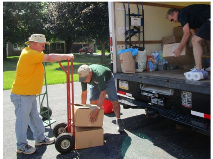
The Susquehanna Lions staged another very successful "Fill The Truck" event June 23-25 at the Manchester Giant.