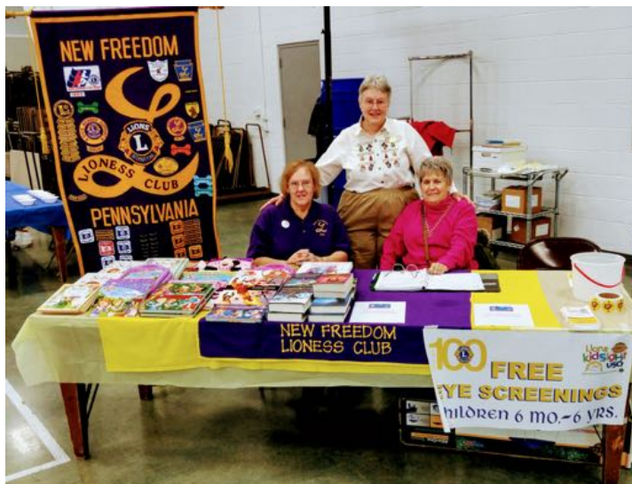
above: The New Freedom Lioness Club offered free vision screenings in November.