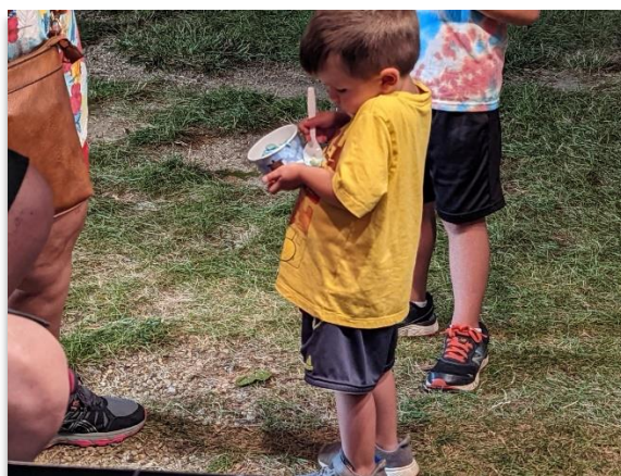
We Serve.....Ice Cream!

I am looking forward to working with all of you this Lions year, thanks for the opportunity to serve.