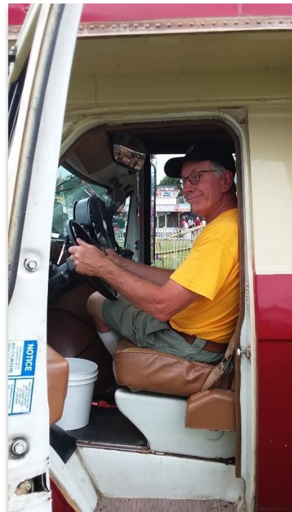
Working The Bonkey's Ice Cream Truck