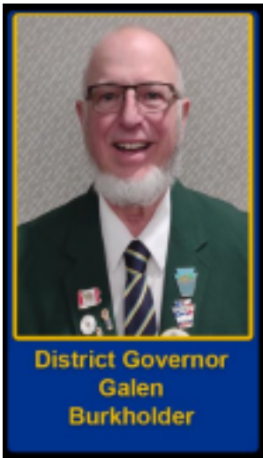
District Governor Galen Burkholder