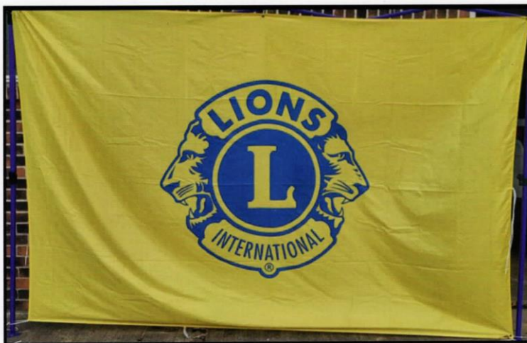
6'x10' Back Panel for 10'x10' Pop-Up Awning (awning not included) $35