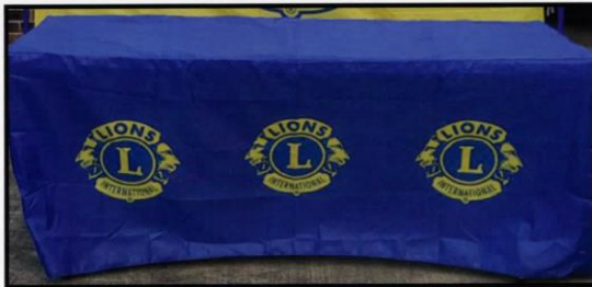
6' Table Cover $35