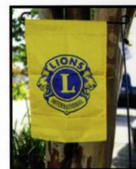
12"x18" Garden Flag (stand not included) 15