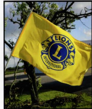
3'x5' Standard Flag (pole not included) $20