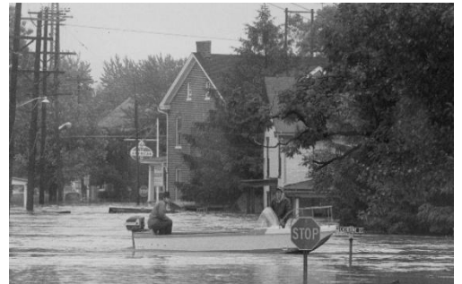
Flooding - Agnes 1972