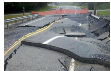
Roadway damage - Lee 2011

Learn more about flooding and what to do at https://www.ready.gov/floods .