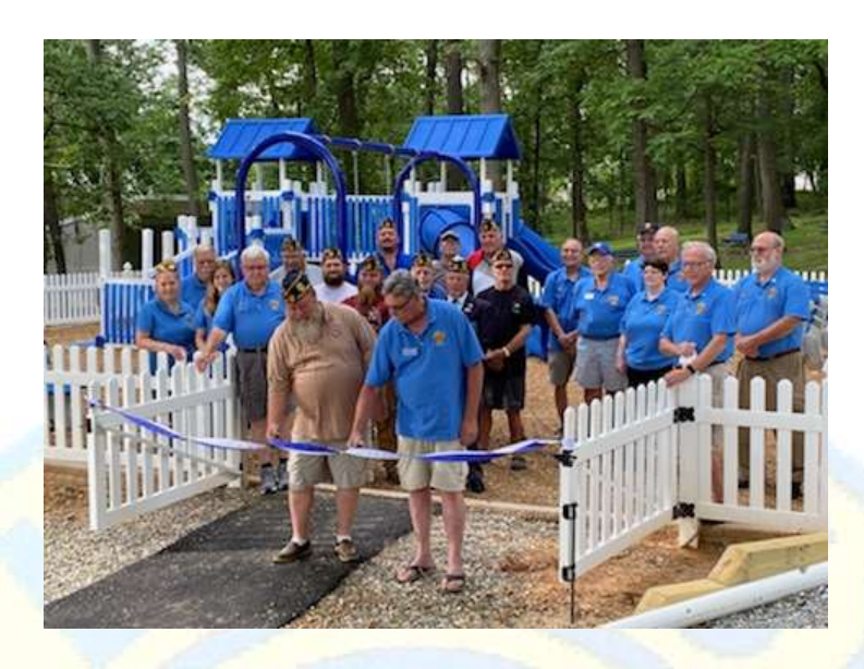
(Dallastown Lions Club and Dallastown American Legion, Post 605)