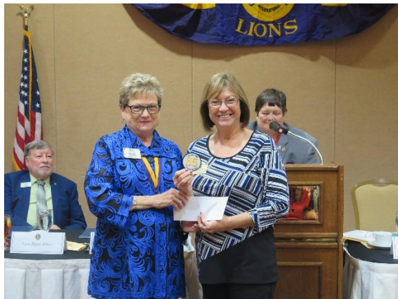
(Pineville Lions Club: 65 year patch)