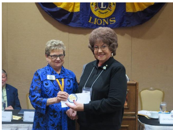
(Marlinton Lions Club: 65 year patch)