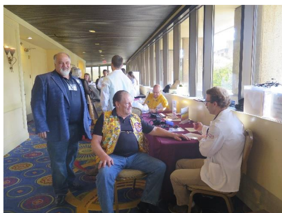
(FVDG Boyd & PDG Queen Health Inspection)