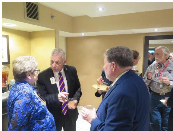
(Rest assured of tall tales being told)