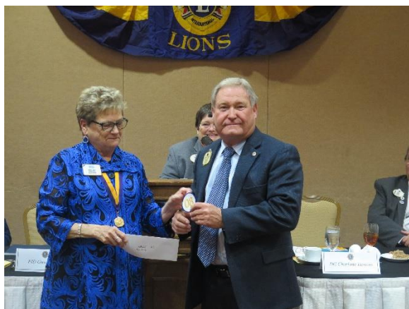
(Oak Hill Lions Club: "08" year patch)