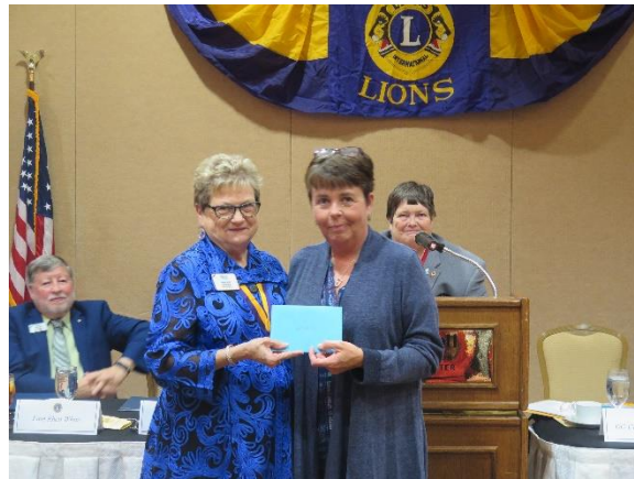
(Oak Hill Lions Club: DG Contest)