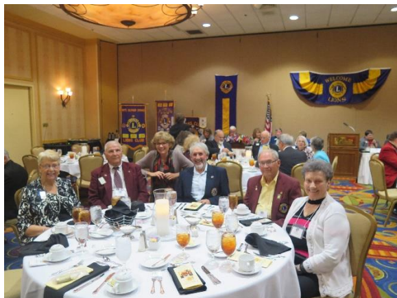
(White Sulphur Springs Lions Club)