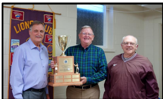
The Traveling Trophy presentation to the Athens Lions Club after their 2014 tournament victory.