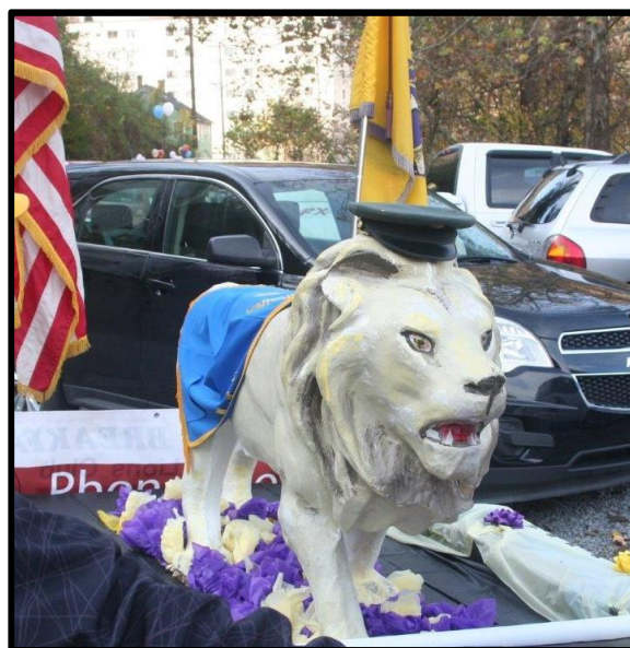
GARY the Lion has new home with Gary Lions

The Governor's Theme Change with Creativity represents the new 29-C and the changing creative spirit in Lionism Past, Present, and Future.