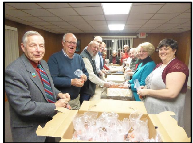
Durbin Lions prepare gifts for Santa's bag.