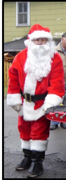
Lion Santa all decked out for the Durbin Lions Club's Santa Run.

The Durbin Lions began the Santa Run tradition many years ago and have faithfully kept it going each year. The number of children has dwindled over the years for whatever reasons, loss of population being one, with about 40 children participating this year. The Lions still feel it is worth the effort just to see the smiles on the faces of the children when they see Santa and get their gifts.