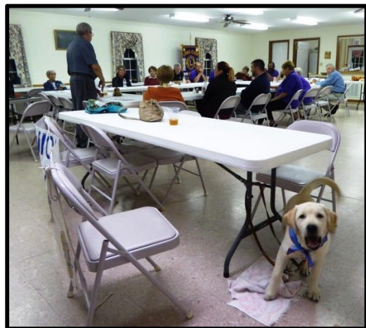
At a Union Lions Club meeting.