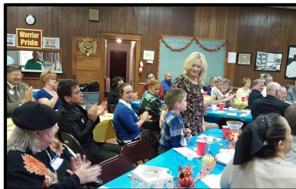
The mother of a 2 nd grader expressed her appreciation for Lions vision screenings at the Green Bank Elementary School. The screening found a problem in her son's vision which has since been corrected.