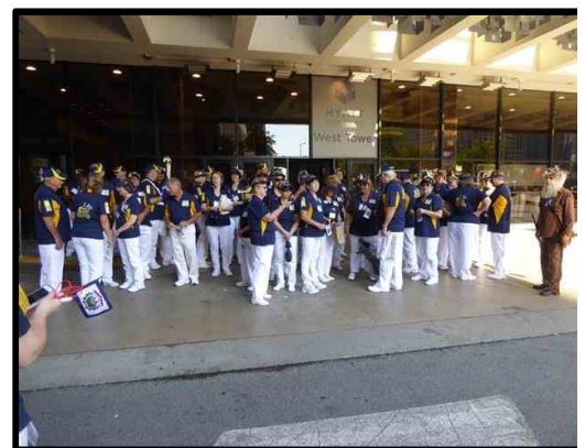
A large group of WV Lions made the journey to the Windy City.