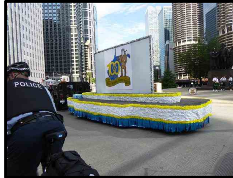
The WV Float. It was a beautiful day for a parade. Chicago area Lions worked for 5 years to make the Convention a success!

Photos & captions courtesy Lion Carolyn Sheets