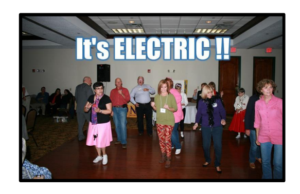
Doin' the Electric Slide!