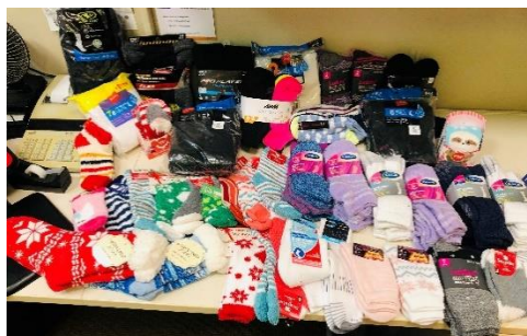
Socks for Seniors

The club sponsored a scholarship for an elderly lady eyeglass purchase.