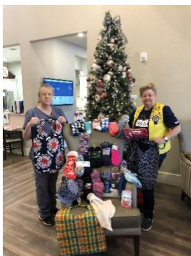
Delivery of Socks, adult bibs and blankets