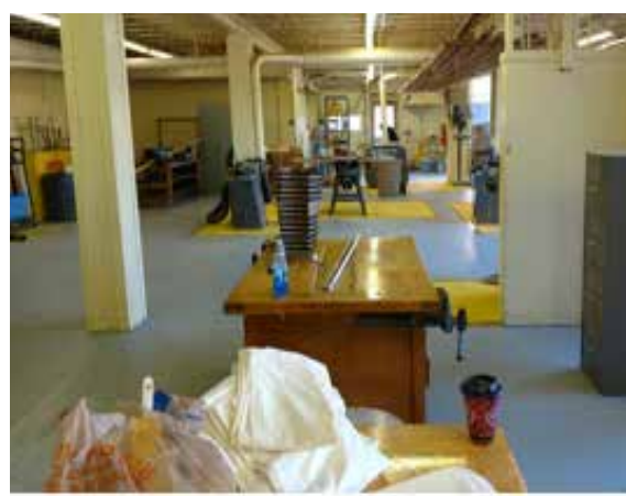
This is a little Idea of the Physical size of the project. To the left are the North Windows and to the right and left are the wood working benches. Some of the power equipment can be seen in the background.