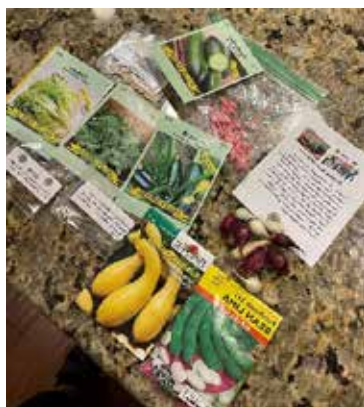
Example of a Packet