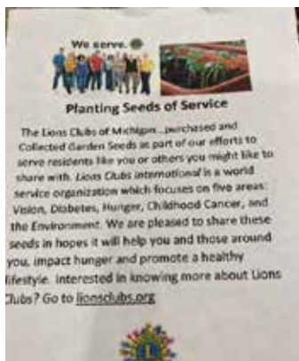
Information put in each packet

Each District was asked to bring 1000 seeds. Each District was assigned a vegetable, 11D1-Summer Squash. Some Districts bought bulk seeds and others bought seed packets. We then assembled seed packets. We received about 100 seed packets with seeds from each District.