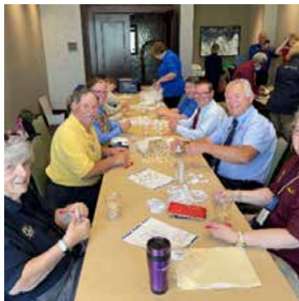
Lions putting packets together