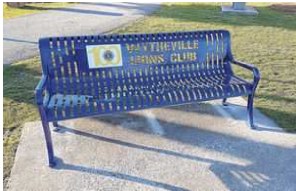
To commemorate the 100 th anniversary of Lions Club International, Wytheville club members donated a park bench at Wither's Park.

"Reach the Summit Through Teamwork". Lions Club International has reached their centennial year and we have been successful because we are focused on the same goal: serving those in need. Be it on a global level or a local level, Lions truly live up to the idea "where there is a need there is a Lion". This year we will continue the Centennial Service Challenge and are expected to reach our goal of 100 million people served well before the June 30th, 2018 deadline. The Lions of District 24-F have embraced this challenge and made it their own. Lions Club International has added a new layer to the Centennial Service Challenge; clubs are being asked to leave their mark on their communities through the Centennial Community Legacy Project.