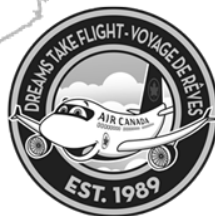
"Dreams Take Flight"