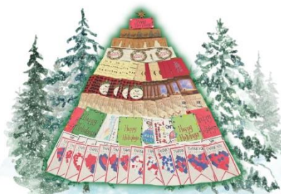
(Christmas Tree of Cards for Troops)

$500.00 WISD - Dr. R.E. Margo Elementary School Winter Coat Drive