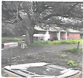
$300 DONATION TO HELP A CITIZEN