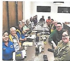
DISTRICT 2-A3 ZONE MEETING