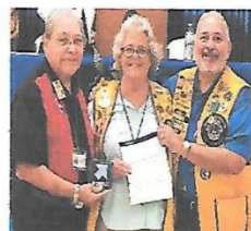
DONNA LIONS CLUB GETS THE 1.5 M AWARD