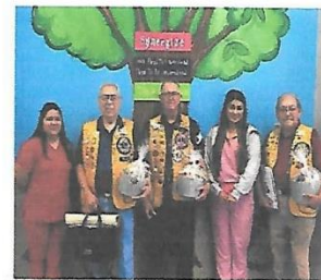
V. S. IN WESLACO ISD DID 1443 SCREENINGS