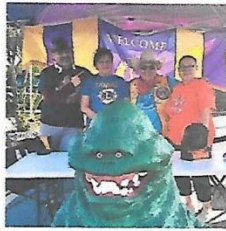
$100 DONATION TO HALLOWEEN PARTY FOR CANDY