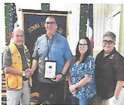
R. AWARD TO OUR POLICE CHIEF