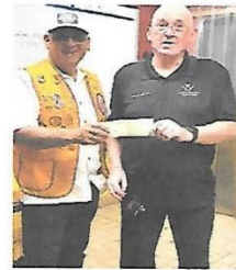
$300 DONATION TO OPEN HANDS FOR FOOD