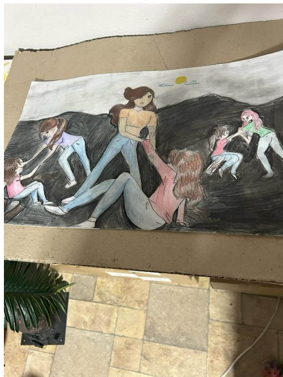
Edinburg Lions Club