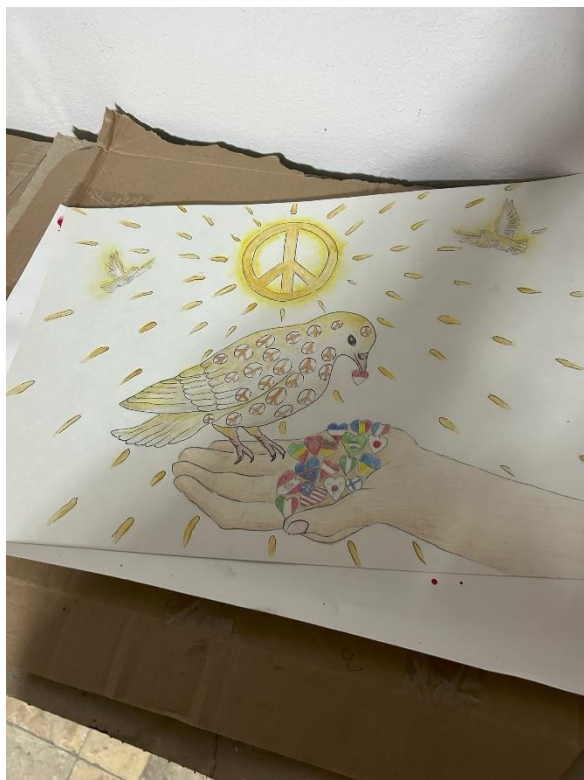
Donna Lions Club