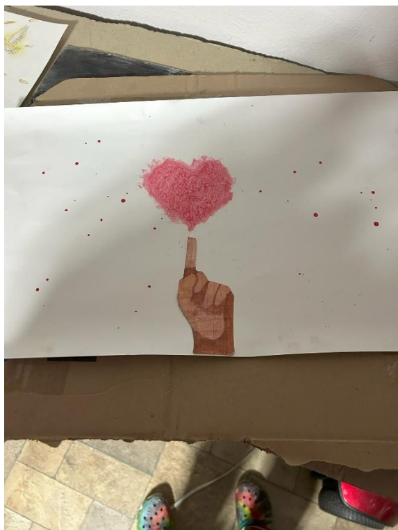
Kingsville Noon Lions Club