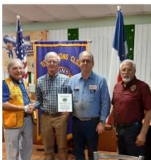
Donna Lions Club Recognition Award presentation to a Business in town.