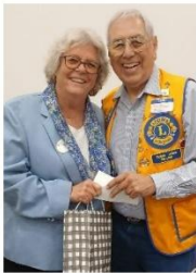
DONNA TOTAL DISASTER DONATION To LCIF and TLF WAS $3050