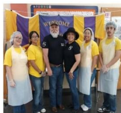
Donna North High School Leos workin with the Lions on a Fund Raiser event