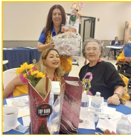
West Brownsville Lions and the Alamo Lions had a great time at the Second District Cabinet Meeting held in Mercedes, Texas October 18, 2025