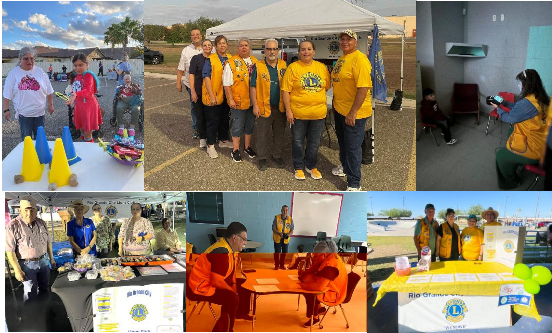
(Top Row- Fall Festival, Lions Club volunteering, Vision screening; Bottom Row- Market Days, Screenings at elementary, Alzheimer's Awareness Event)

The Rio Grande City Lions Club has been staying active this year, by sending a donation to Kerr County flood victims, by having a bake sale during Market Days, and continuing with events into October. Members provided vision screenings at local elementary schools, joined the 4th Annual Alzheimer's Awareness Walk, and had a game booth with prizes at the Starr County Nursing and Transitional Care Fall Festival for residents and guests. The club continues its eyeglass recycling campaign with the help of local businesses, so far since the summer we have collected over 350 pairs of glasses. Rio Grande City Lions Club is keeping up with the spirit of Lionism.