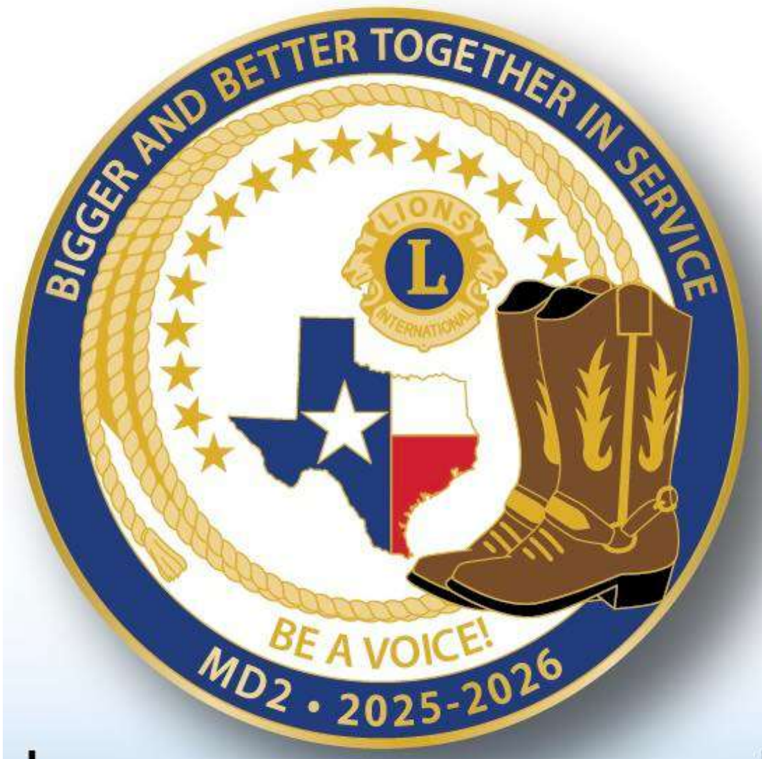
MD2 State Pin