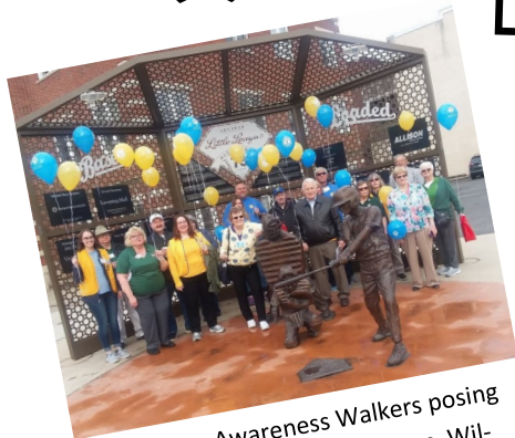
Diabetes Awareness Walkers posing with the Little League Statues, Wil- liamsport