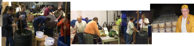
The beginning process of cutting and packing cabbage in the barrels, followed by salt being added and stirred to allow settlement and fermentation with the help of members of the Leo Club.