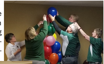
Both photos were taken at the Vice District Governors Retreat in Harrisburg at no cost to the leaders. Active participation in areas of working as a team for the betterment of the planning or project.

Let's keep our district strong and continue with efforts