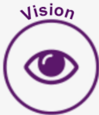
Vision Screening for Children

https://cdn2.webdamdb.com/md_IJaltfE1WIB4.jpg.pdf?v=1