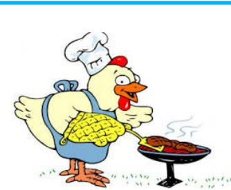
American Legion North Carolina

Serving groups and individuals, the Ferguson Township Lions Club reputation for preparing and cooking delicious chicken has not gone unnoticed! Recently, the club prepared, cooked, and served 550 barbecue meals with homemade applesauce!