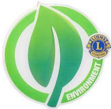
Young Tree Care

https://cdn2.webdamdb.com/md_IUrfc4Bw021.jpg.pdf?v=1