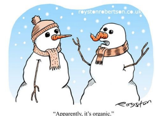
"Apparently, it's organic."