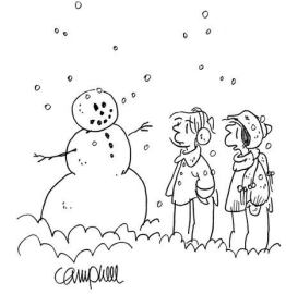
"The snow came from the clouds, but it was assembled in America."