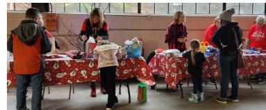
Milesburg Lions Wrapping Presents