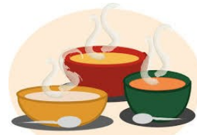
St. Margaret's Episcopal Church