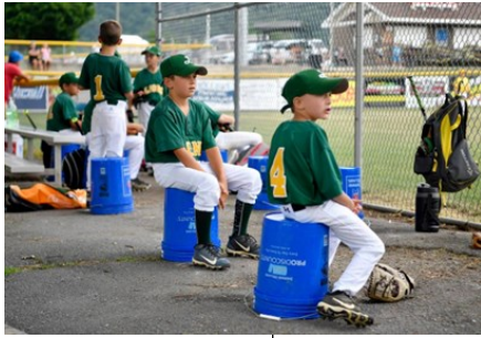
Centre Daily Times