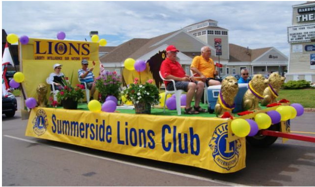
Participating in the annual Lobster Festival parade.