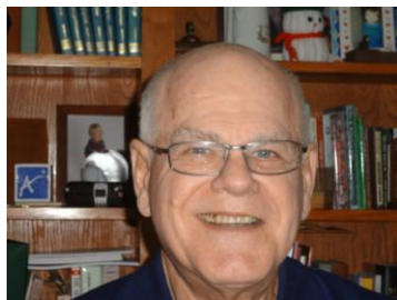
Fellow Lions of District N-1

It gives me great pleasure to write my first letter to you as 2nd VDG. The year has gotten off to a good start as we enter a second century of Service to our communities, nation and world. It is through our efforts that we make this world a better place for all to live in.