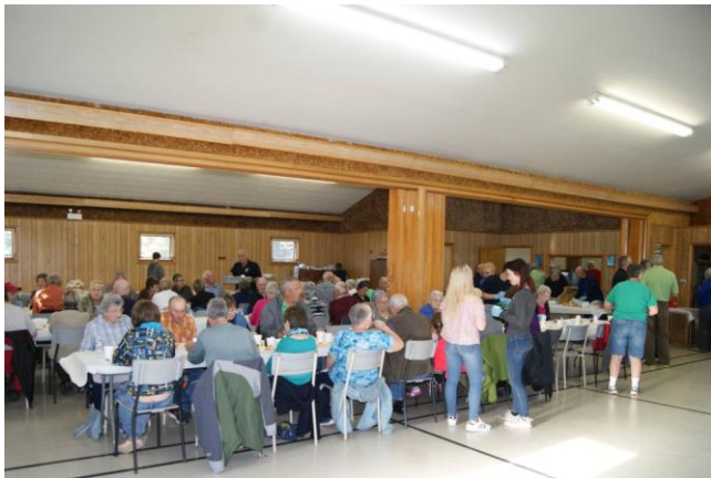
More than 425 diners were served during the annual Roast Pork Dinner on October 21.