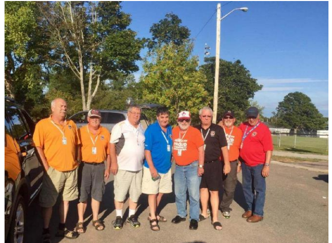
Photo shows several Summerside Lions who volunteered to drive the teams at the recent under 15 baseball championships held in Summerside.. Over 500 man hours were logged by members over the course of the tournament.

Summerside Lions Club have been off to a busy start to their year