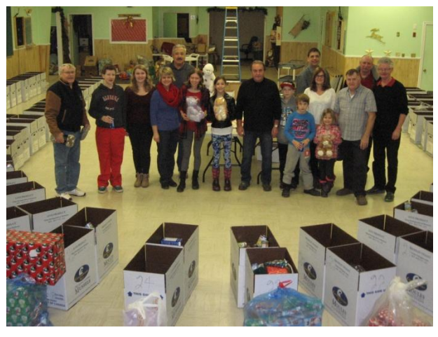
See caption, next page