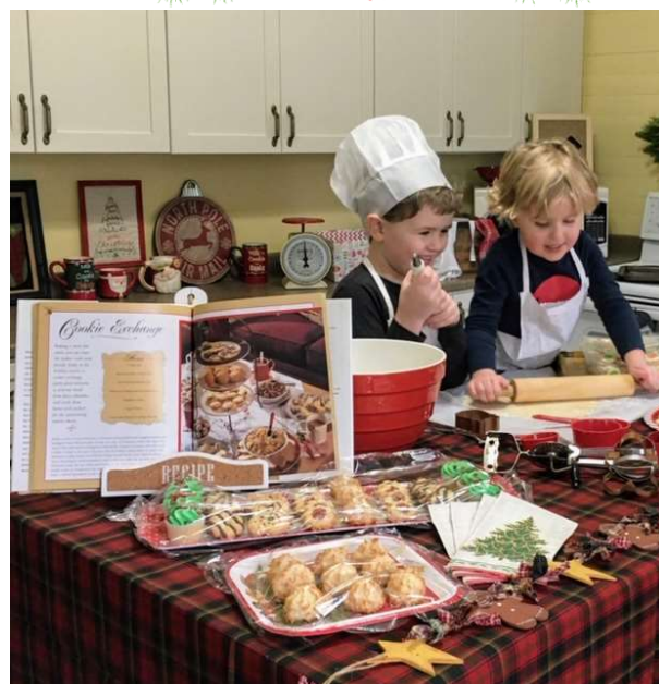
NML’s “Kitchen” scene.