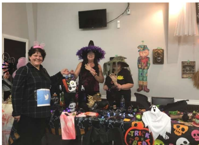
Pictured above, the “Social Butterflies”, during the Geary Lions Club’s Trunk or Treat event. The picture shows three generations of Lions members, actively involved in club activities.