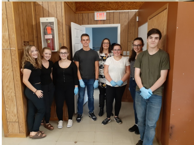
Students from Three Oaks Senior High School and

Lions Club members and volunteers made the annual Summerside Roast Pork dinner a success.