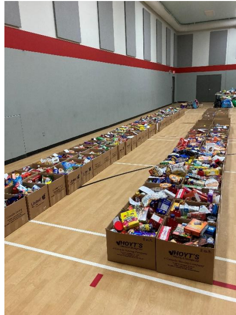
Above: Some of the 140+ food boxes for distribution. Below: Food delivered to the Community Kitchen to support their needs.

practice, cooking chili (beef and veggie), cornbread muffins and cookies, The event generated an amazing $3200+ "at the driveway", which NM Lions topped up, allowing a $2000 contribution to the FHS Nutrition Program, and jointly, FHS and NM Lions donated $1000 to each of New Maryland Elementary School and Bliss Carman Middle School, for their nutrition needs.