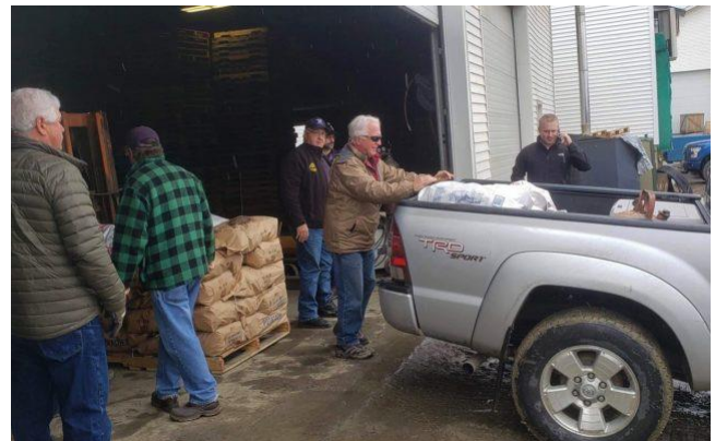
Members of Fort Kent Lions Club load potatoes, to deliver to local restaurants, food banks and families.